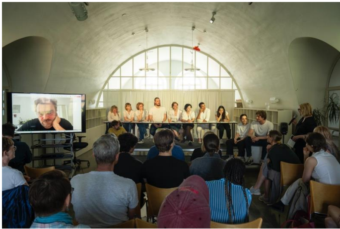
A drama reading festival organized by TINFO in collaboration with Nordic Culture Point and the Theatre Academy in May 2024.