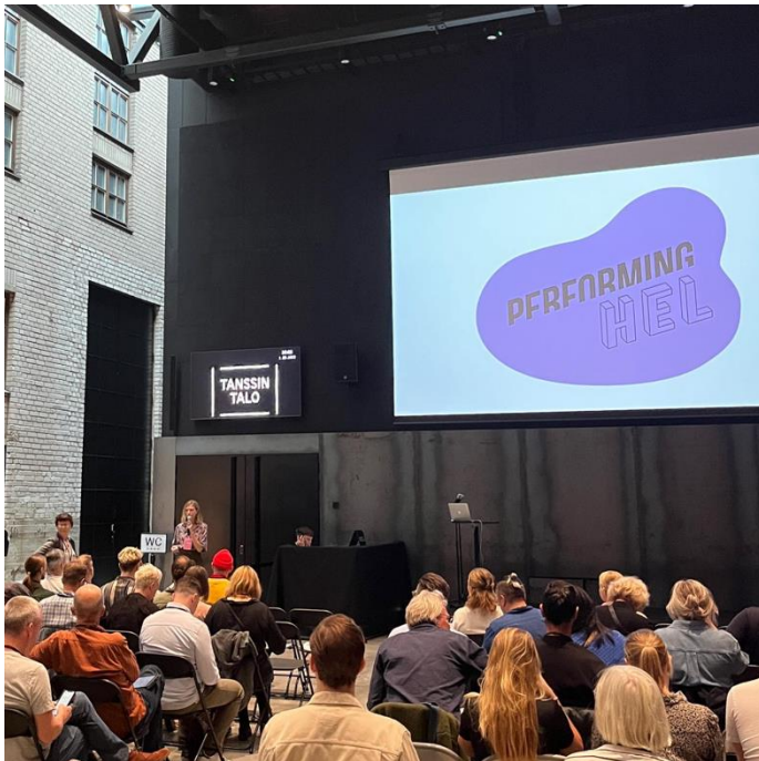
The Performing HEL showcase in 2023.