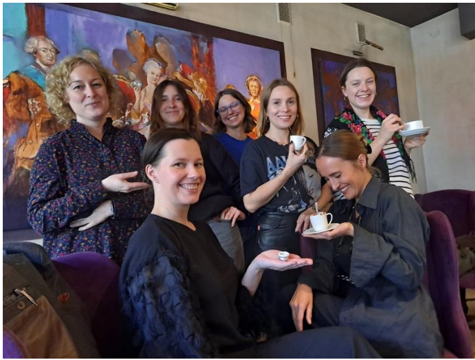
The Secret Feminist Society of Helsinki during a joint planning session with the Sirenos festival in Lithuania in 2023.