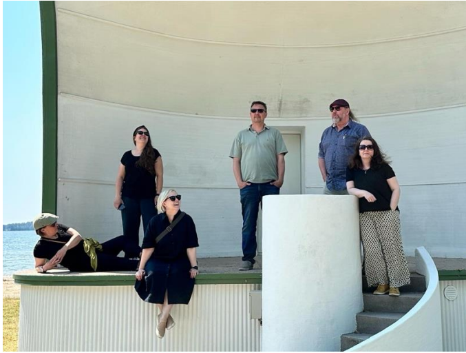
The staff of TINFO during a recreational day in May 2023.